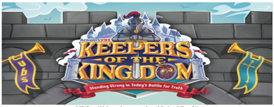
VBS will be the week of July 17 - 21